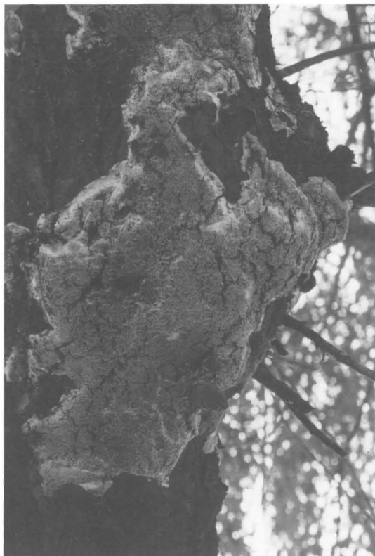
Fig. 2. Inonotus pruinosus Bondartsev. A fresh basidiocarp (Dai 2126). Photograph in situ on 23.IX.1995, x0.3.

mouths mostly entire, sometimes more or less lacerate, matted. Subiculum umber brown, very thin (not exceeding 1 mm), fibrous to corky. Tubes yellowish brown to umber brown, having pale stripes of stuffing mycelium, fibrous to woody fragile, up to 20 mm long, annual layers distinct, up to 3 layers in the present material.